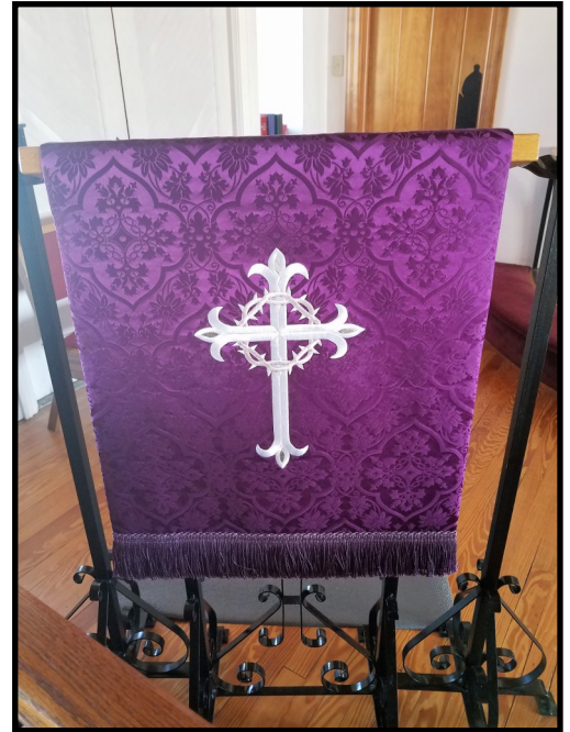
Chapel parament during the Lenten season.

Black—meaning mourning, is used only on Good Friday (if any paraments are used).